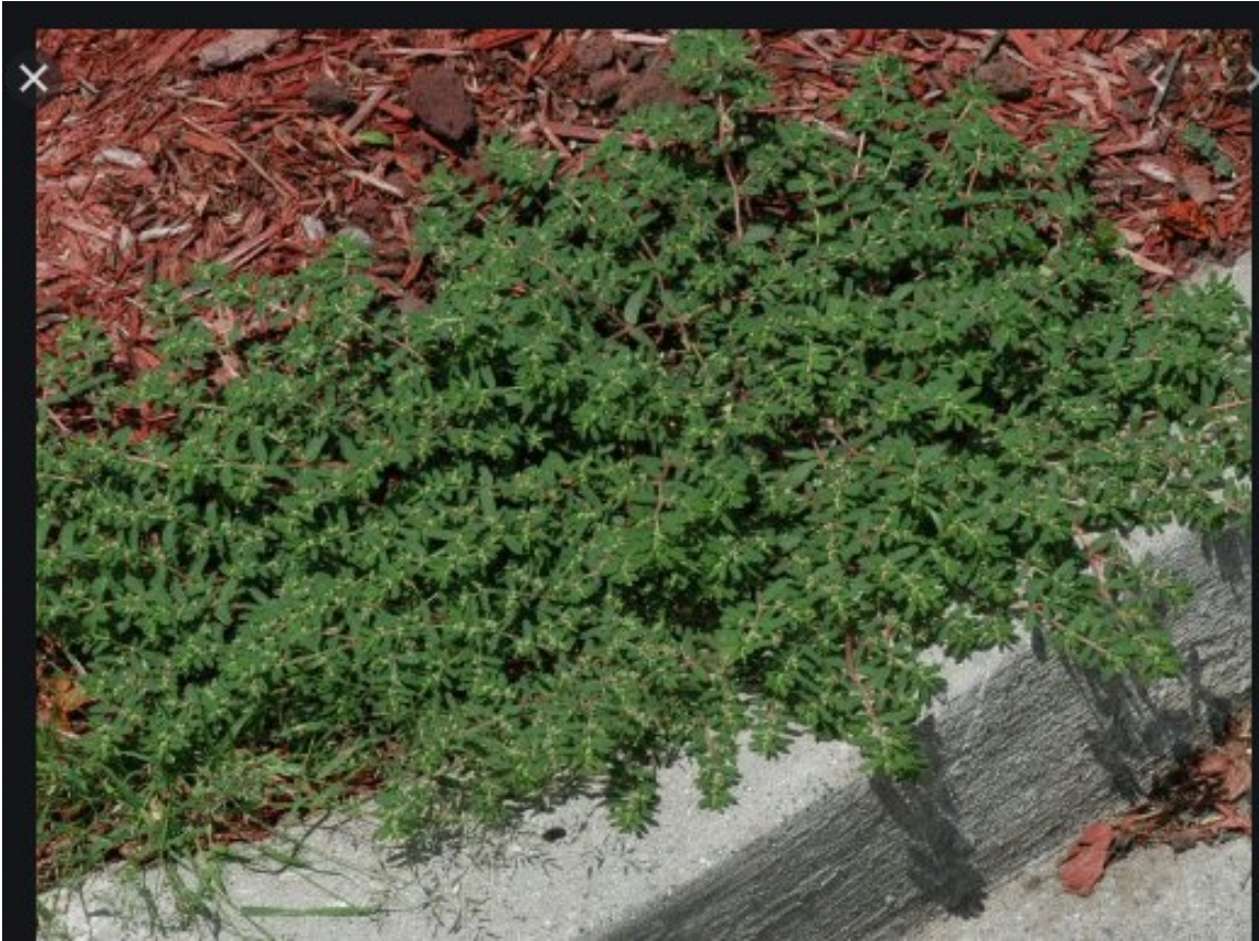
Morning Glory Weed